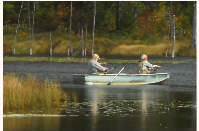
Once Upon a Pond

At this time, the help I'm asking for from a few of you is the help that your talent, expertise, or common sense can contribute. We need to fill Board seats! Three incumbent Board members are seeking reelection; however, there are three vacant slots to be filled. It is extremely important that we have a full Board. The future viability of LLHA depends on it!